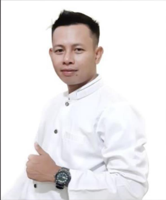
Tukul Sutrisno Commisioner